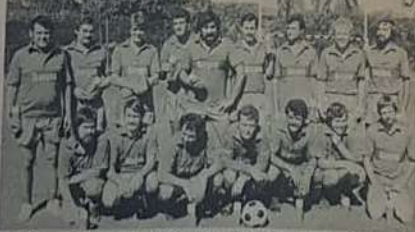
THE German soccer squad who are having their best season for years in the Farang Soccer League